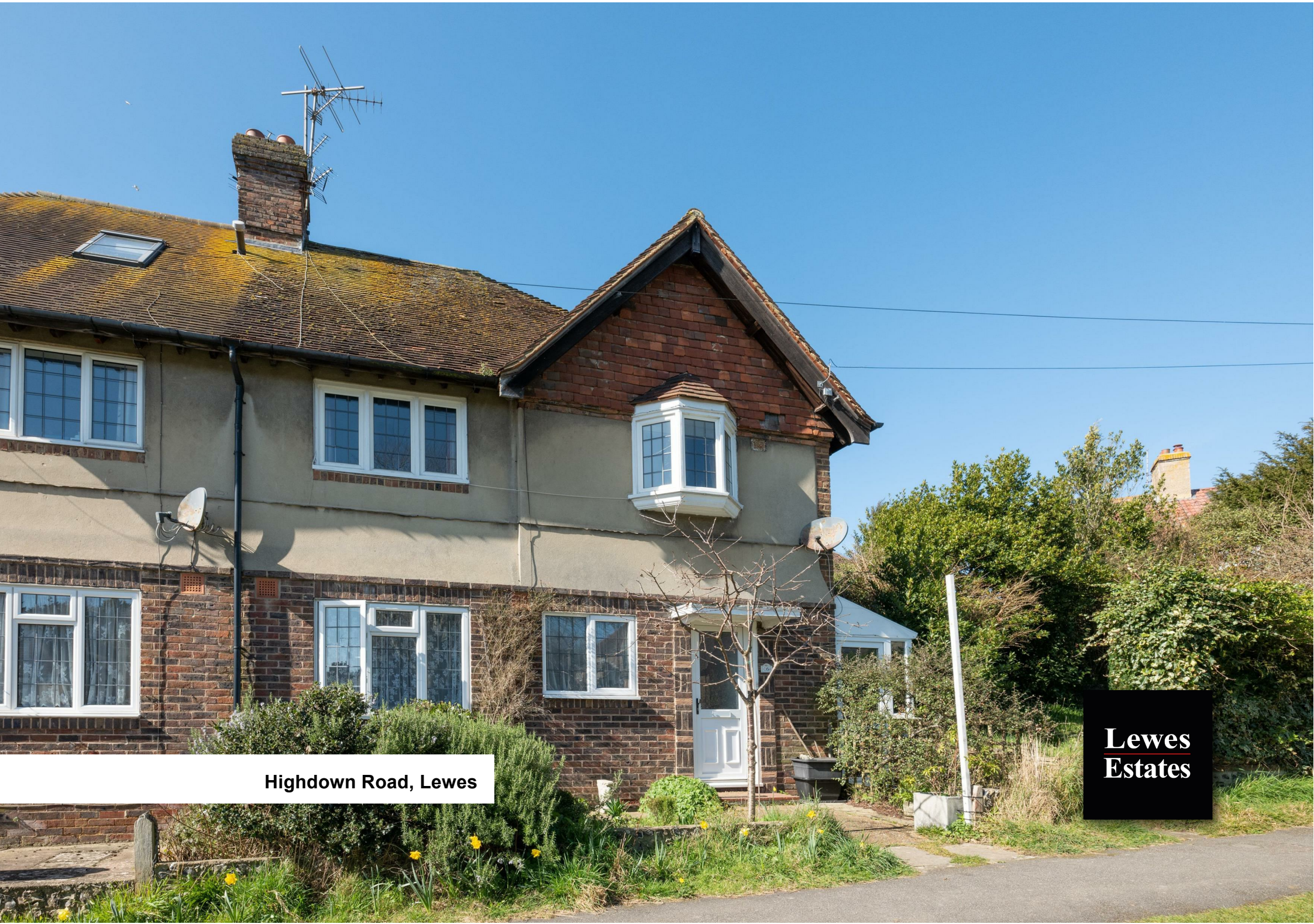
Highdown Road, Lewes

GROUND FLOOR 543 sq.ft. (50.5 sq.m.) approx.